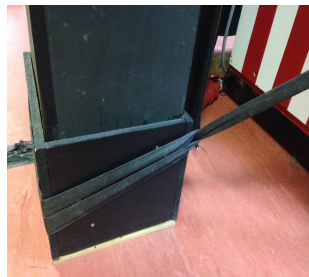
Use of pillars