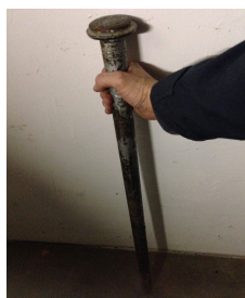
Iron stakes used outdoor on grass