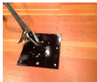
Rigging plate attached on wooden floor with screws