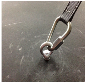
Attachment in concrete wall